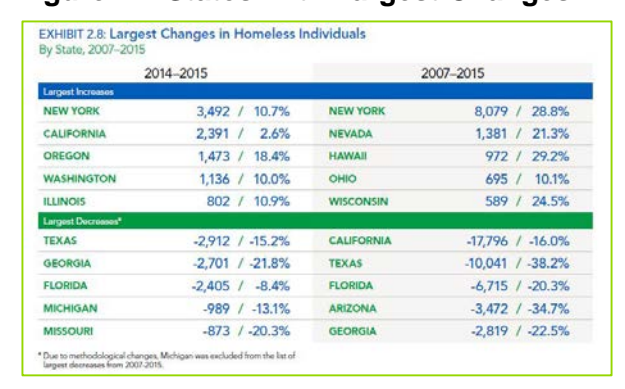
Figure 22: States With Largest Changes in Homeless Individuals, 2007 – 2015